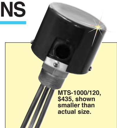
MTS-1000/120, $435, shown smaller than actual size.

Wattage: 0.75 to 3 kW Power: 120 and 240V, 1 phase Watt Density: 64 to 86 W/in 2 Screw Plug: 1 NPT stainless steel passivated screw plug Enclosures: E1 general purpose, NEMA 1 (IP00) rated, or type E2 moisture-resistant/explosion-resistant enclosure. 2