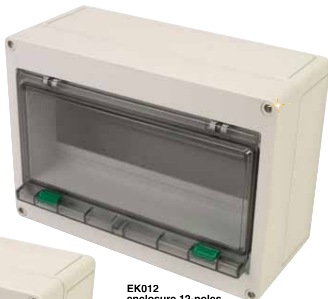
EK012 enclosure 12-poles.

The EK Series polycarbonate enclosures are a unique design to house and protect standard IEC components, such as DIN rail mount circuit breakers, timers, switches, meters and other control devices. The unique cover design features a shrouded cut-out and transparent hinged doors with push release doors latches, for quick access and visibility. The shrouded cut-out, spanning the width of the cover, exposes mounted components for easy adjustment and isolates wiring for increased safety.