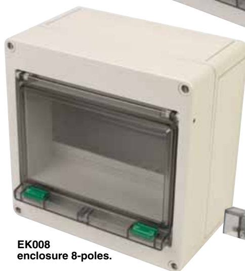
EK008 enclosure 8-poles.