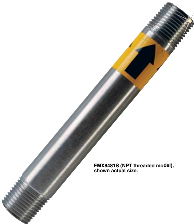
FMX8481S (NPT threaded model), shown actual size.

Typical applications include laminar or turbulent blending, liquid/gas contacting, and enhanced heat transfer. The mixing process is modular: the more difficult the application, the greater the number of elements required.