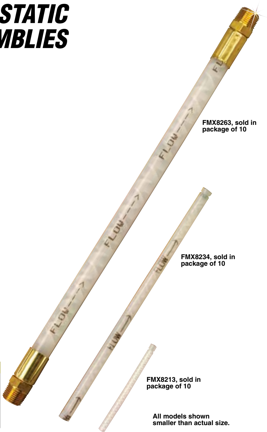
FMX8263, sold in package of 10