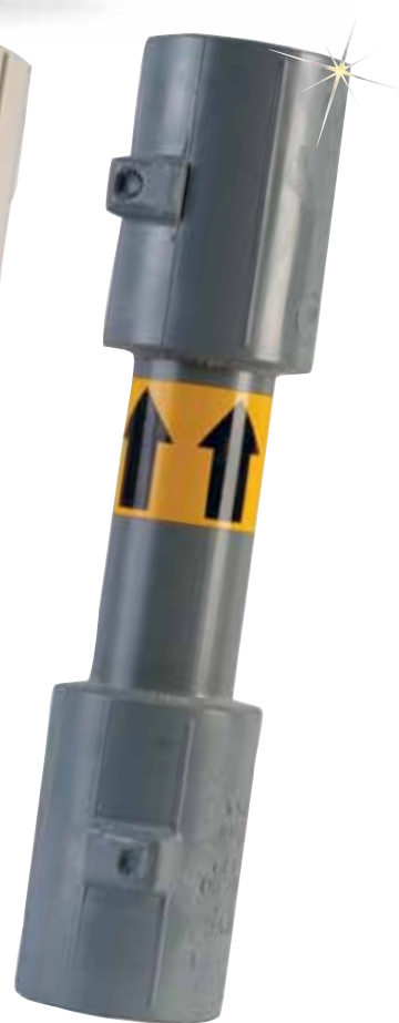
FMX7221-CP (above) and FMX7251 (left) NPT threaded model, shown smaller than actual size.